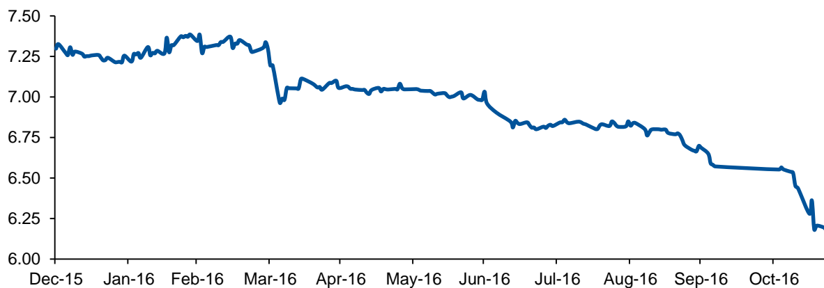
Chart 1: India's 1 Year Government Bond Yield (%)

Staying with the banks and using data supplied by the State Bank, cash deposits received into the system 14 days to the week ending 25 th November totalled US$104bn (52% of sum withdrawn), with US$32bn of that already "re-monetised" (16% of sum withdrawn), resulting in a collapse in deposit rates and bond yields; the polar opposite currently experienced by all other major economies. Further downward pressure is likely as additional funds enter the system, all of which will in time be channelled into the economy productively, one way or another. Recent fund data suggests that the equity markets are already seeing flows, a trend which could gather steam as the country's savings are intermediated into the formal system, structurally lowering the cost of capital. The billion dollar questions are by how much, how quickly and to what effect?